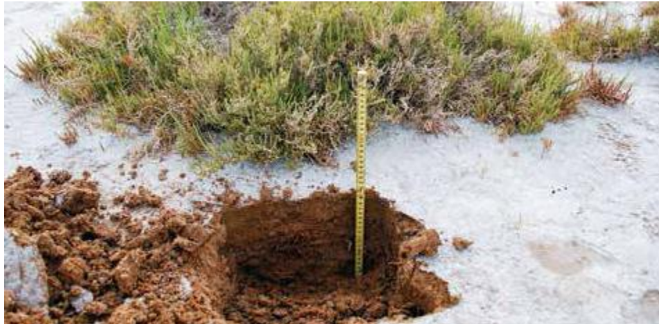
Soil Profile of Solonchak (Chott el Djerid, Tunisia)