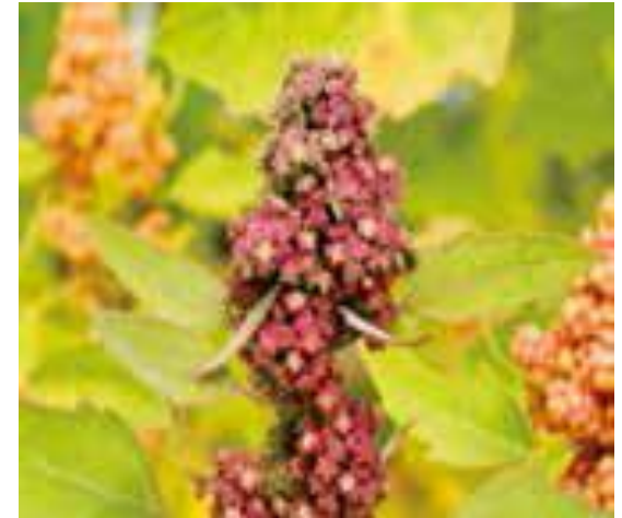
Industrial plantation of Quinoa in flowering and fruit maturation stages on salt affected and poor nutrient soil (Issyk-Kul, Kyrgyzstan)