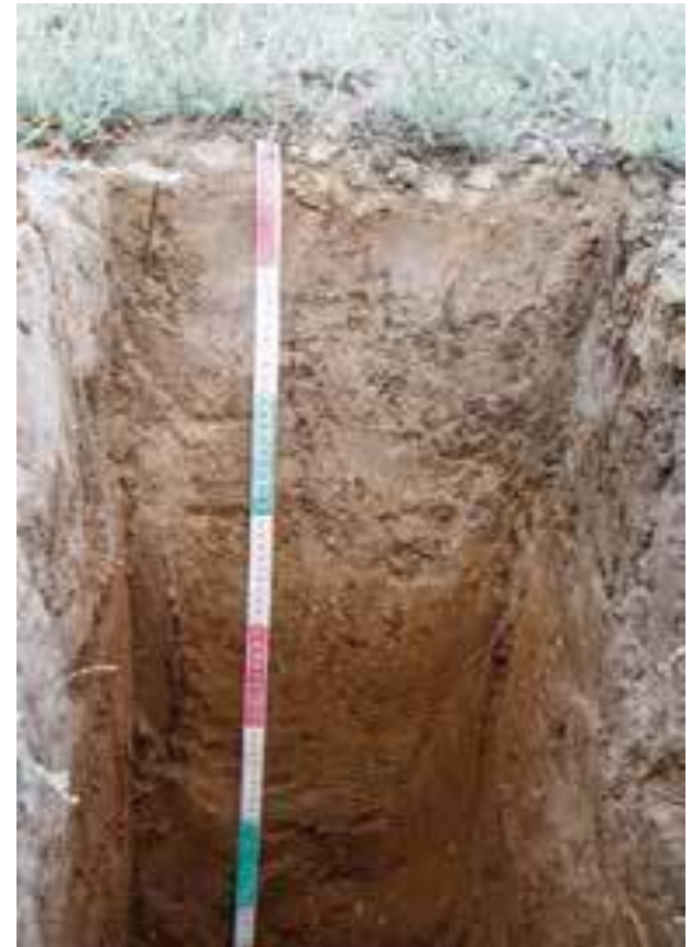
Soil Profile of Solonets (Kalmykia, Russia)